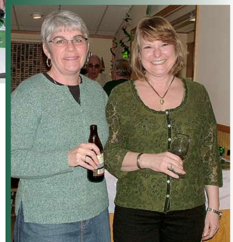
And more St. Patrick's Day gathering pictures