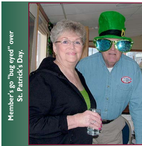
Member's go "bug eyed" over St. Patrick's Day.