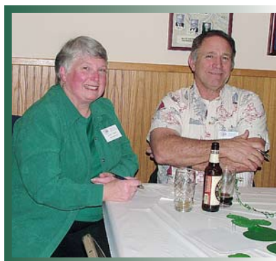
St. Patrick's Day gathering