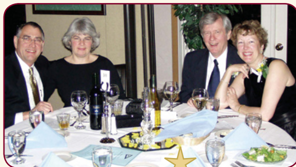
Commodore's Ball 2005

RCYC Commodore's Ball at Riverside Country Club, festivities start at 6:00 pm