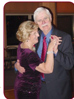
Commodore's Ball 2004