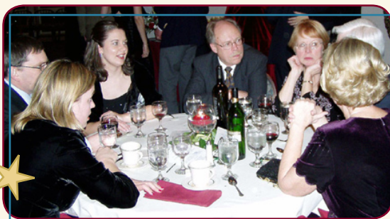
Commodore's Ball 2004