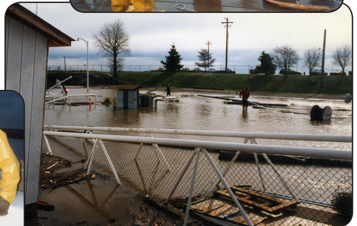
Remember when: February 1997 Flood