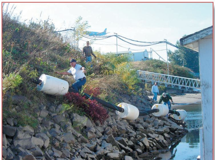
October Workparty - Last one is 11-03 RCYC Work Party, 9:00am