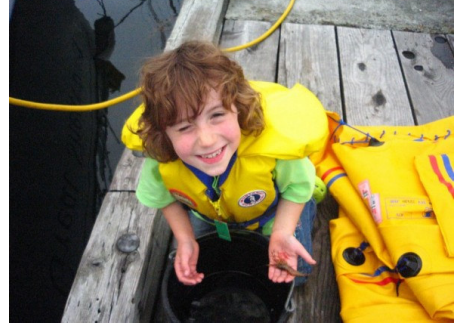
The Love of Fishing.