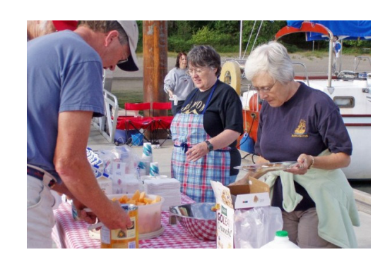
A little breakfast for the pirates