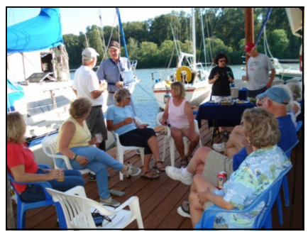
Lazy Days at Cathlamet