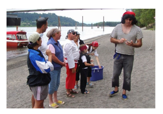
New members being quizzed.