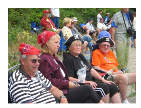
When does swabbing the decks start?