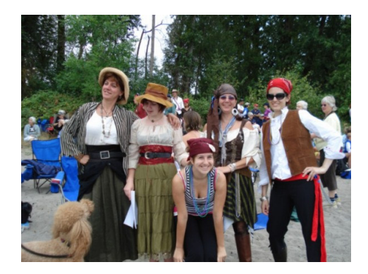
A bevy of swashbuckling beauties.