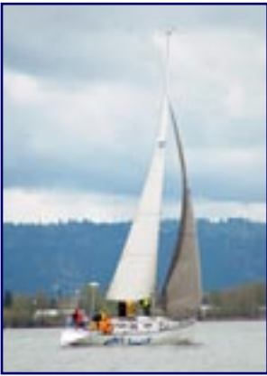
No-Fly-Sail-1 Division winner "Wave Dancer" heading back up wind.