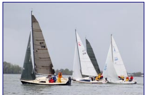
Organized chaos in the pre-start for the 172 Fleet results in a tight first leg.