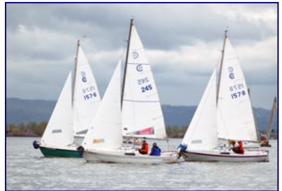
Tight racing in the Cal 20 Fleet.