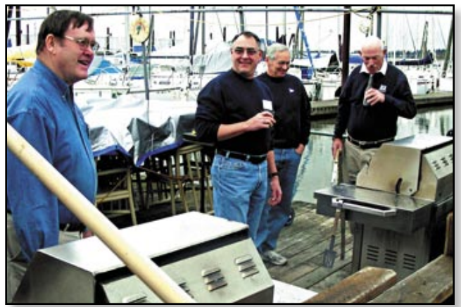
Walk I BarBQ is fun even in the rain