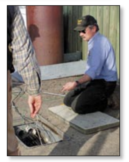
Lets turn on the water!.