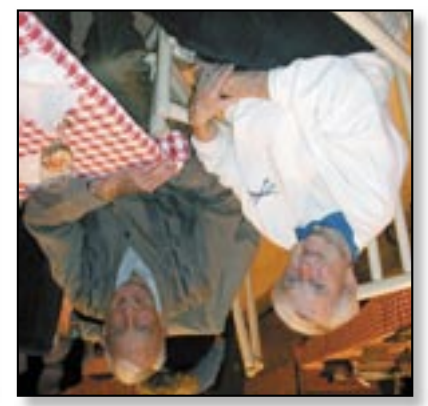
Page 8 April 2007