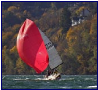
Kahuna seeing a little drama downwind

We were less than an hour into the race and it was time to turn the corner. I was beginning to remember why I prefer the downwind legs on Gladiator after only another hour of racing.