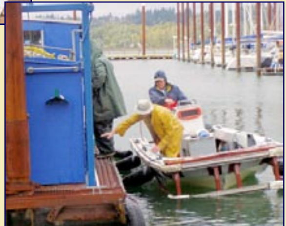
Work boat for transferring crew