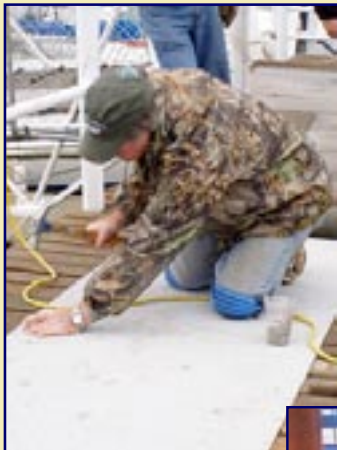
Replacement beams at top of ramp