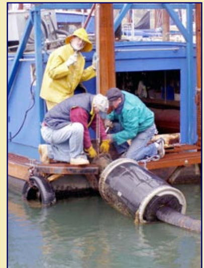
Dredge - connecting spoils pipe