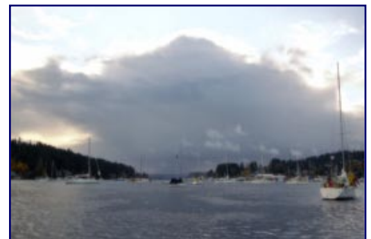
Get ready, get set, everybody get below!

First gun, and the big players are off; second gun and it was anchor up, sails up, drive around some big boats and start to jockey for a hole to get out of the harbor. Mostly painless for us after we got around a Beneteau 461 that helped to hold up some of the other boats in our fleet, but we had some ground to make up on a T-Bird and an Express 27 that got away early. Out of the harbor and then north in Colvos Pass for five or so miles. It was a one jibe strategy for us; starboard chute run to Vashon Island in a steady 15 knots, find a hole and jibe and head to the rounding mark on the west side of Colvos