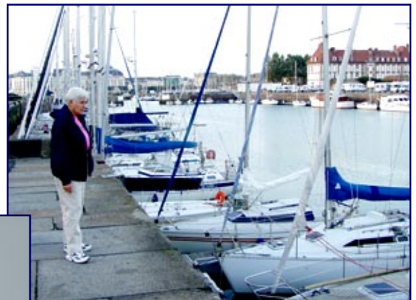
Harbor Deauville, Normandy, France (over 20ft tides)