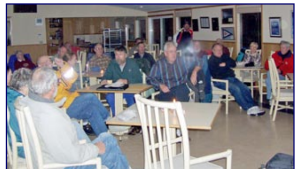
November General meeting by candle light.

Our budget meeting in November provided the opportunity to look ahead to the needs for 2007 and we created a proactive budget which set money aside for these additional projects.