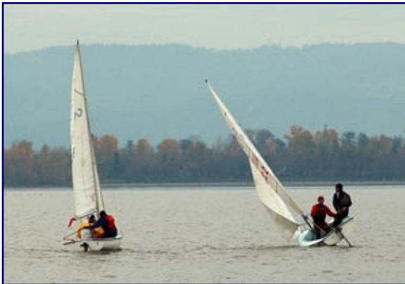
RCYC & WSC in a tacking duel

handling and lots of quick action definitely ratchets up the fun factor. Sailing as a "team" event? You bet!