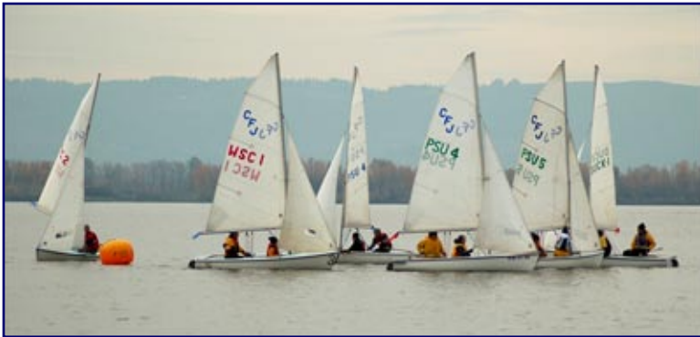
Team racing as close combat—it's all a game of control

TEAM RACING—a little game of three-on-three. If you have never heard of team racing, you are missing out on one of the fastest growing and fastest-moving types of sailing around. Clubs in this area have been participating for several years; in fact, RCYC was the first winner of the WSC Invitational Team Racing Challenge in 1961. The game is sweeping the east coast and seems to be going strong here in P-town. This November 18 and 19, five teams met at Vancouver Lake to determine who would take home top honors this year in team racing. The teams of six members each represented RCYC, Willamette Sailing Club (WSC), Vancouver Lake Sailing Club (VLSC), Portland State University (PSU), and the Portland Cal 20 Fleet. Racing was hosted by VLSC in a combination of CFJs provided by PSU & VLSC.