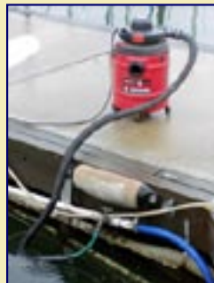
Blowing out the water from RCYC dock water system