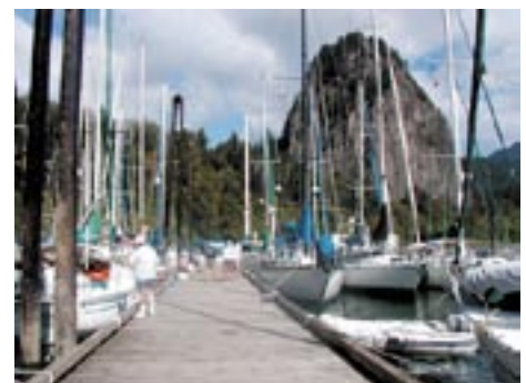
2004 Beacon Rock Cruise