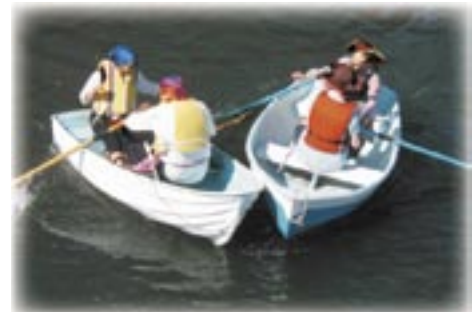
Let the games begin...