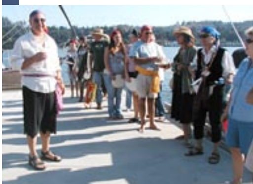
Pirates at the Pirate Breakfast.