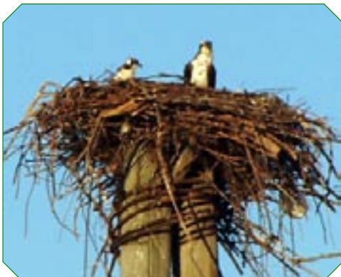
Osprey family from Walk 1

hot afternoon in St. Helens where we watched Pirates of the Caribbean at the local theatre for $4.00, anchoring in the Walker Island cove, enjoying the relative coolness of Cathlamet, riding the Astoria trolley, having a great 7 knot upriver sail from Astoria to Cathlamet, getting stuffed at the potluck and going out to dinner in Rainier. Most of all we enjoyed running into our RCYC boating family all along the way. We had 51 people from 18 boats and assorted cars at the potluck in Cathlamet on the Thursday night and at one time we had a group of 8 RCYC boats in Astoria. The beauty of Lazy Days is that our various paths weave a fabric of friendship as we sail and power our way along the river.