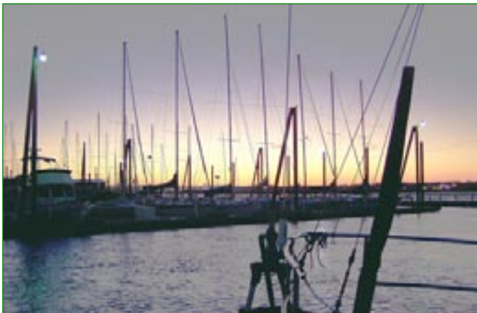
Sunset overlooking RCYC from Walk 1