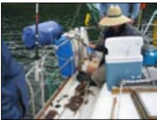
Counting of the crabs.