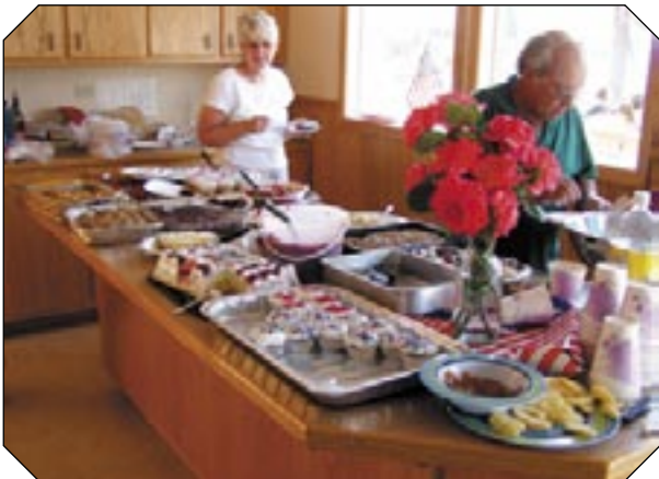
Plenty of Desserts