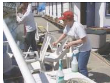
A good day for a work party.

A topic of interest to all of you "Sailors". Standing Rigging--- inspection, adjustment, and maintenance. Just in time for your Summer cruising.