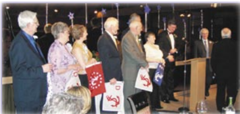
▲ Presentation of the 2006 RCYC Board