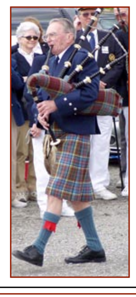
Opening Day Festivities