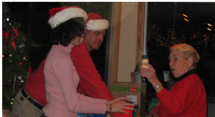
More surprises from the Christmas Ship potluck.