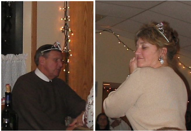
And the real Princess is???????????????