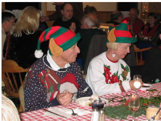
Santa's elves taking a break before the big day.