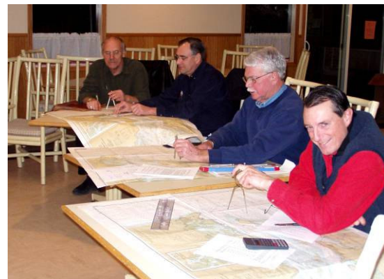
Coastal Navigation Class

The US Power Squadron is offering a BoatSmart class starting January 24th at 7:00pm at the International Air Academy in Vancouver. Call Phyllis Sines at 360-574-6908 to register. There is also a Basic Boating class