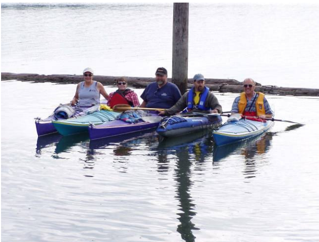
The Kayakers at the starting gate.