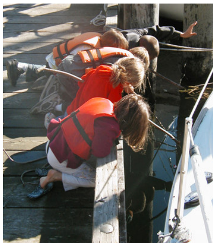
A little fishing.....