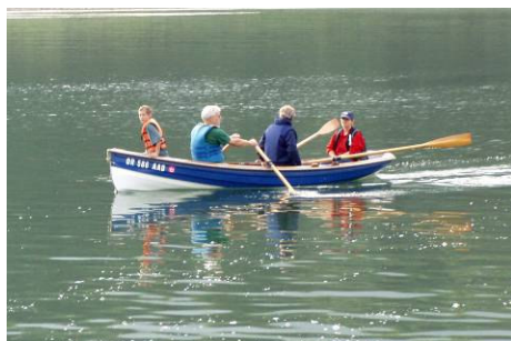
A little work.....