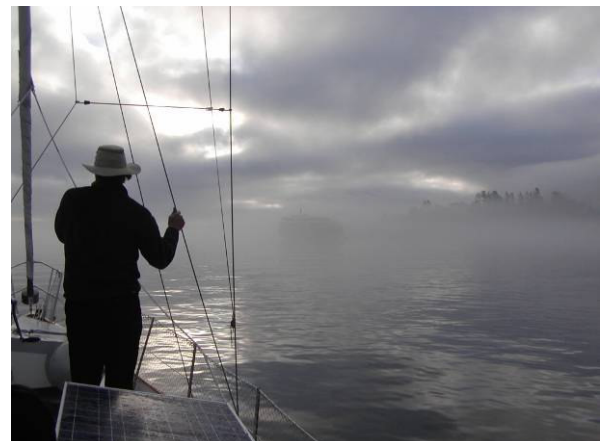
Exiting Neah Bay in the fog. Glad we had our radar!