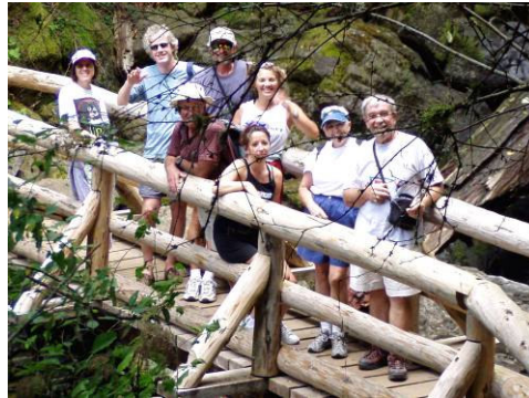
The top of the Waterfalls

We have been reinstated by the Three Points Yacht Club in Des Moines, WA and by Sidney North Saanich Yacht Club in Sidney, British Columbia.