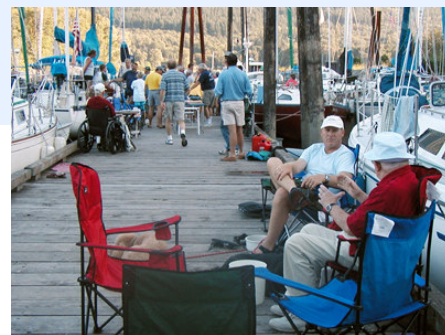
Time for relaxation