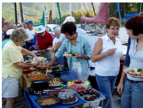
A little food.....

The US Sailing's Annual General meeting will be held in Portland this year at the Benson Hotel October 20-24, 2004. If you are interested, you can obtain more information on their website at: http://www.ussailing.org/EVENTS/meet04fall/index.htm