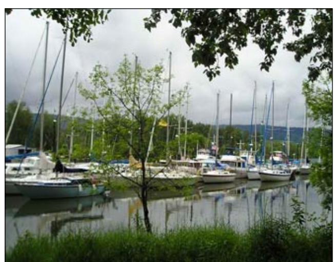
'Da Boats At Hadley's