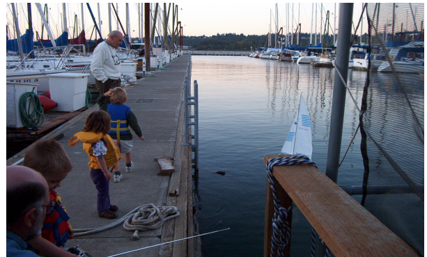
R/C Yacht Sailing at Last Years Octoberfest

Future meeting: May 2 CJ Volesky (503) 668-9153